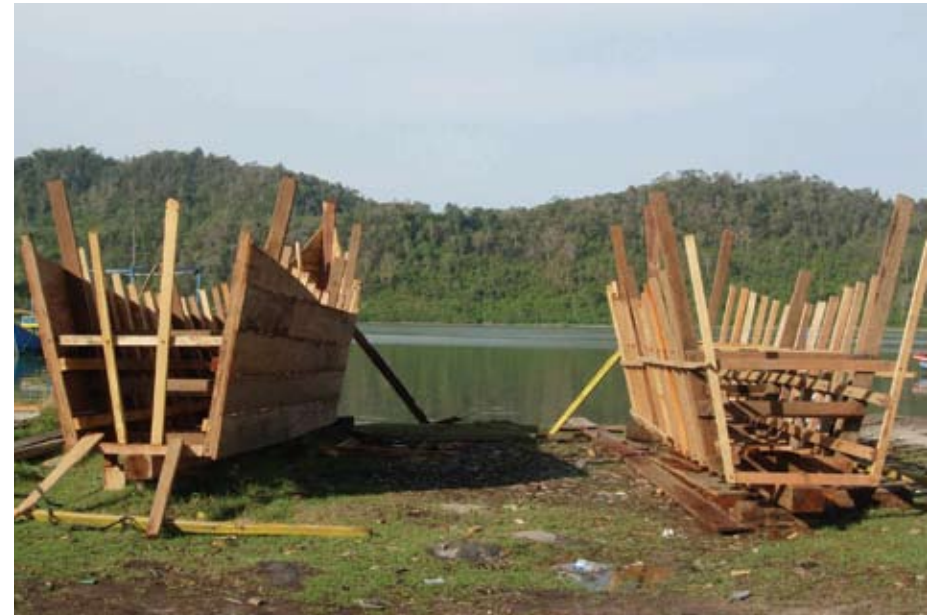
"Palungs" under construction

We knew that Indonesia would be a much more difficult country to work in than India or Sri Lanka, the two other countries most affected by the tsunami. Apart from the level of destruction and the prolonged insurgency, the Indonesian co-operative movement is far closer to the government than we would find acceptable. It is also well known that corruption is endemic in Indonesia – the army expects a piece of every pie. Until the late 1990s, Indonesia was a US-backed dictatorship, notorious for oppression and human rights abuses. And because of the remoteness of Aceh, the language barriers, and the lack of democracy in the country, reliable information is a rare commodity.