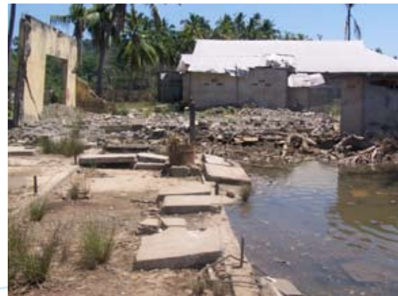
The tsunami destroyed warehouses and processing plants, Andaman and Nicobar Islands

The next few chapters describe the projects we DID support.