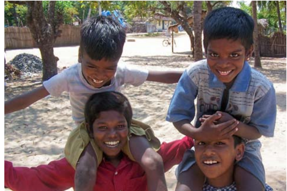
Children in the village of Souankuppam, Tamil Nadu, India, at the site of the new co-operative shop