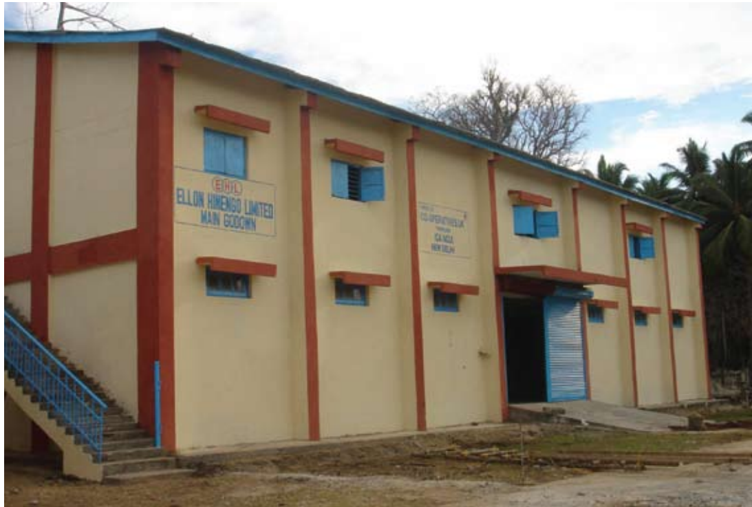
The central warehouse at Car Nicobar