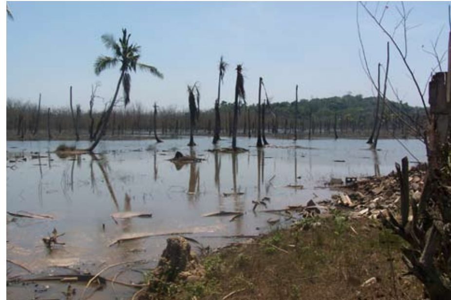
Stagnant sea water remains, and kills the coconut trees

A team effort made the work possible. A group of organisations came together including the office of the Registrar of Co-operatives, Tamil Nadu; the Collector of Cuddalore District; the Institute of Co-operative Management in Chennai, as well as the ICA Delhi office and NCUI.