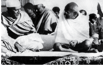
The vision of Gandhi lives on in a co-operative