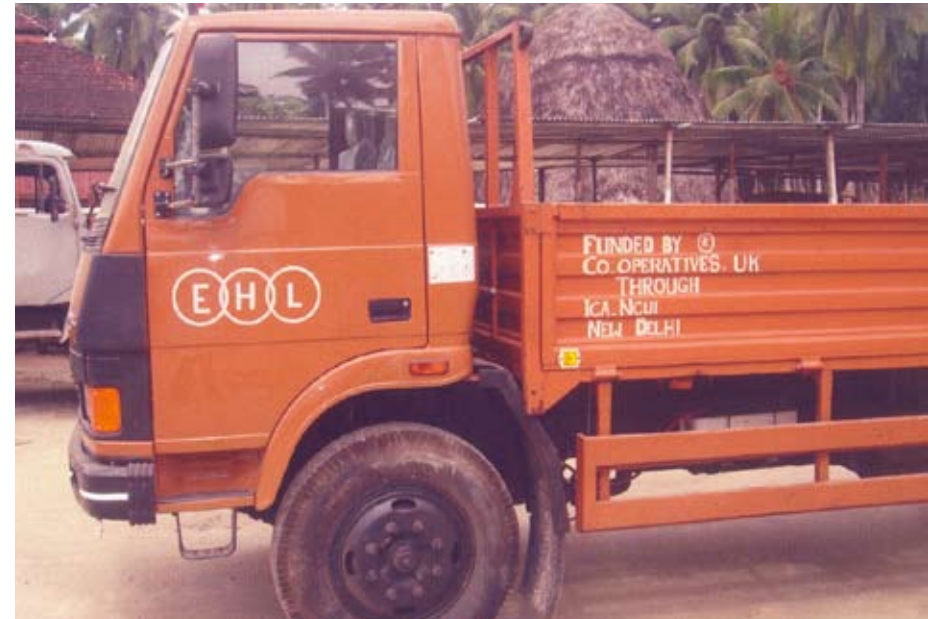
The new truck moves produce around Car Nicobar

Each village has a primary co-operative society (called a panam hinengo in the Nicobarese language that was only written down in the twentieth century by a Church of England missionary). They are actually multi-purpose societies. Members sell to the society the produce they collect and cultivate – coconut and areca nut, which is used in preparing paan . This is a mixture of tobacco and spice, wrapped in a green leaf found throughout India as a digestive aid and mild way of taking tobacco. Each society has a small warehouse to keep the produce.