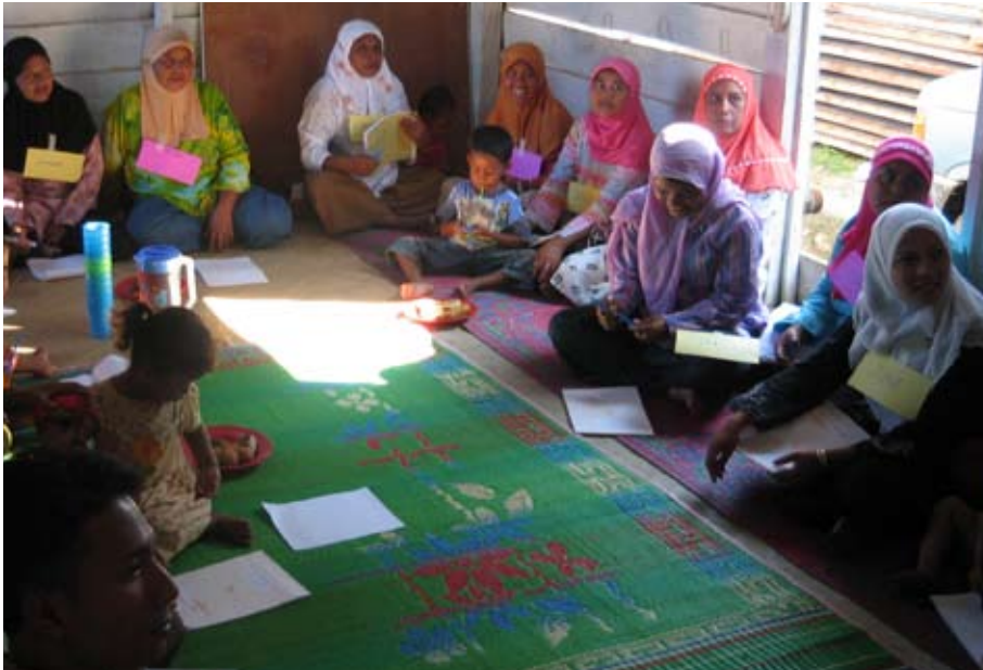
Women members enjoying training

Two special types of wood are required for the construction of a palung – there was no question of giving the co-operative a fibre glass boat that we decided was what they needed! One type – mengkiring – is resistant to salt water. Another type – semantu – is especially flexible and suitable for use as poles that the palung needs.