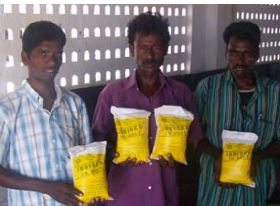
Workers holding iodised salt at Marakanam

The society was set up in 1937, inspired by the Gandhian movement against untouchability. All members are from the 'Harijan community' - Harijan, or 'children of God', being Gandhi's preferred term for untouchables. Marakanam has about 90 active members. As the price of salt in India has fallen, the co-operative has struggled to turn in a profit.