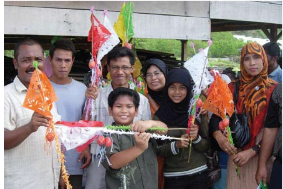
The whole community celebrates when the new "palungs" are completed at Lembah Lhok Seudu in Banda Aceh, Indonesia