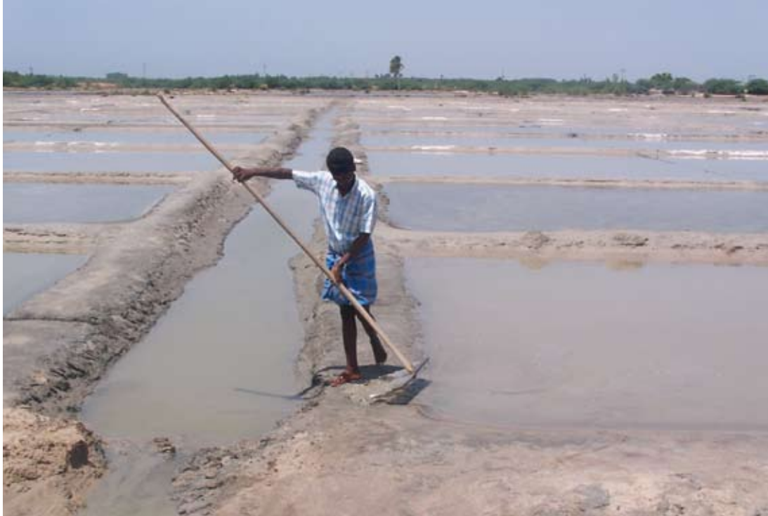
Clearing mud out of salt pans after monsoon rain