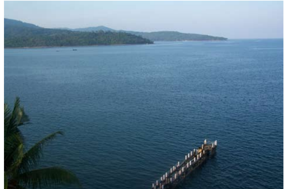
The sea is calm now at Port Blair in the Andaman Islands

A movement of savings and thrift co-operatives called SANASA – the largest of the co-operative organisations in the country – is a good case study of how overseas co-operatives and other donors have co-ordinated on the ground.