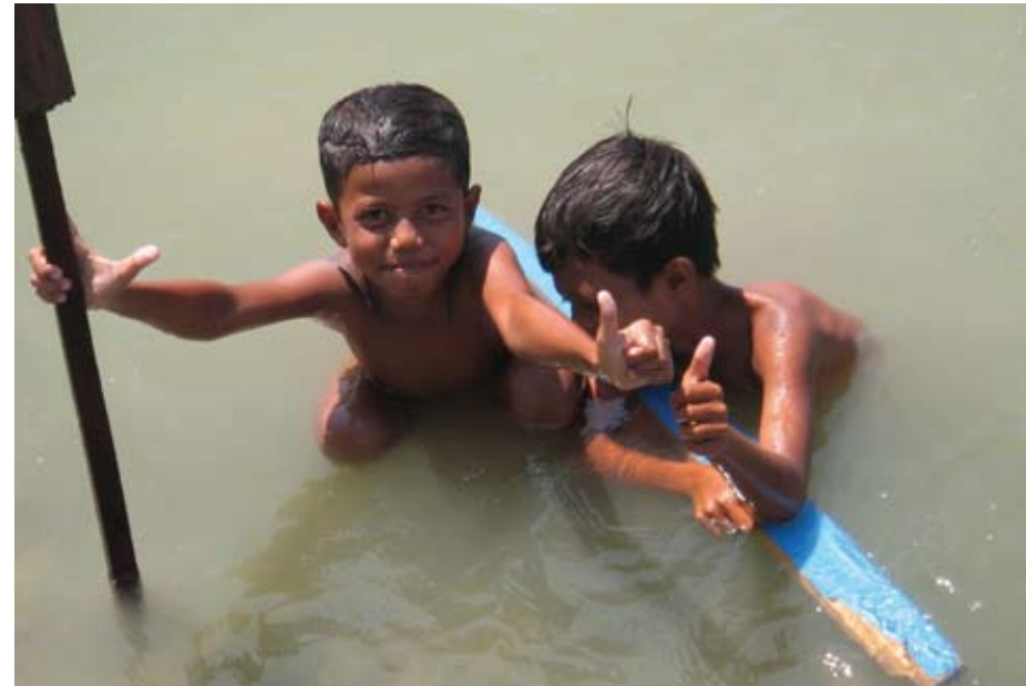
Children swimming around a new boat built by a co-operative in Aceh

All studies agree that the most important source of support when disaster strikes is local people and local organisations.