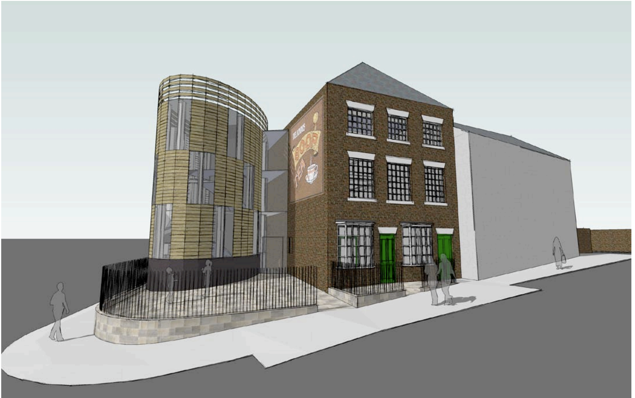
Rochdale Pioneers Museum 13th August 2009 - Proposed Alternative Option