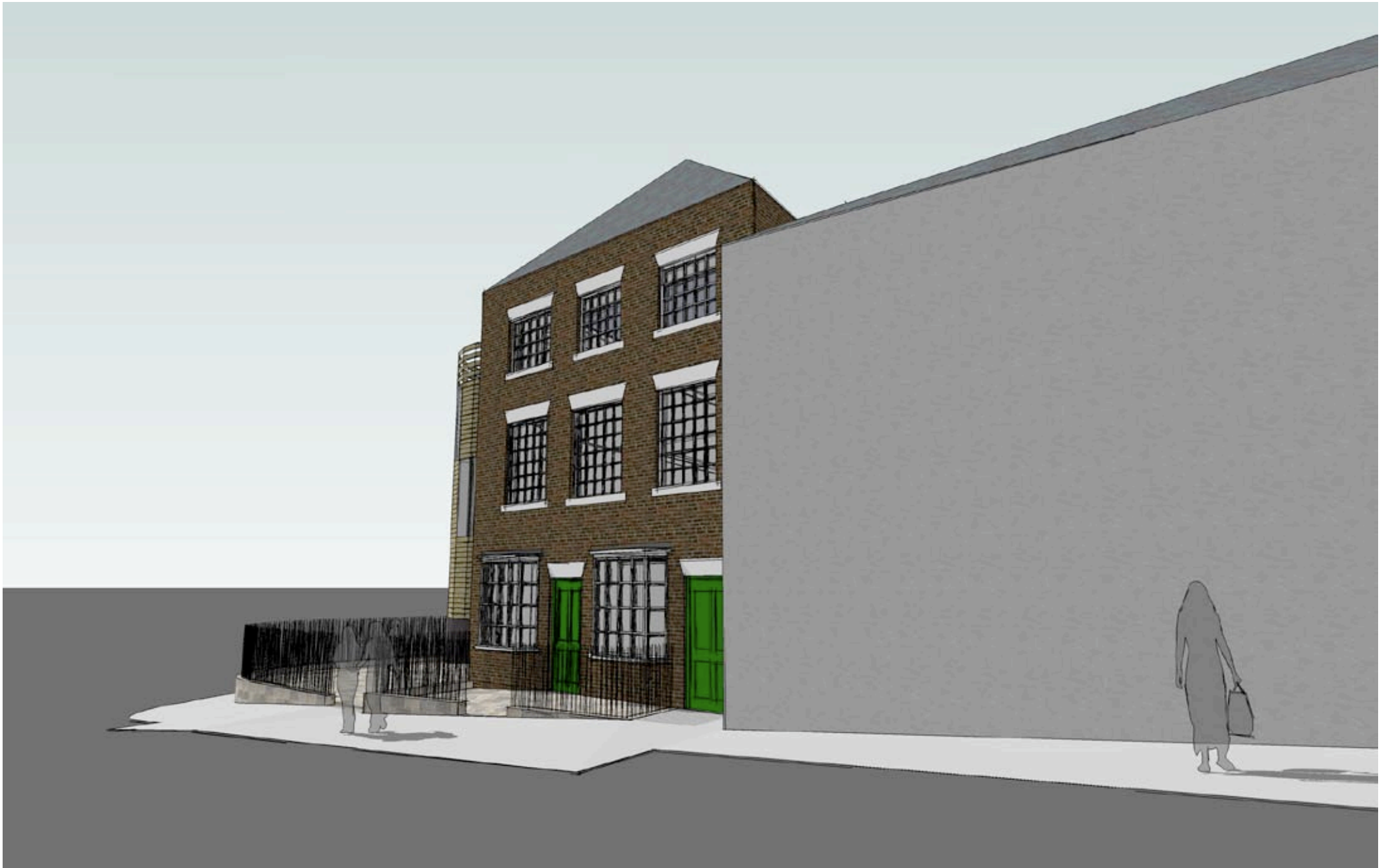
Rochdale Pioneers Museum 13th August 2009 - Proposed Alternative Option