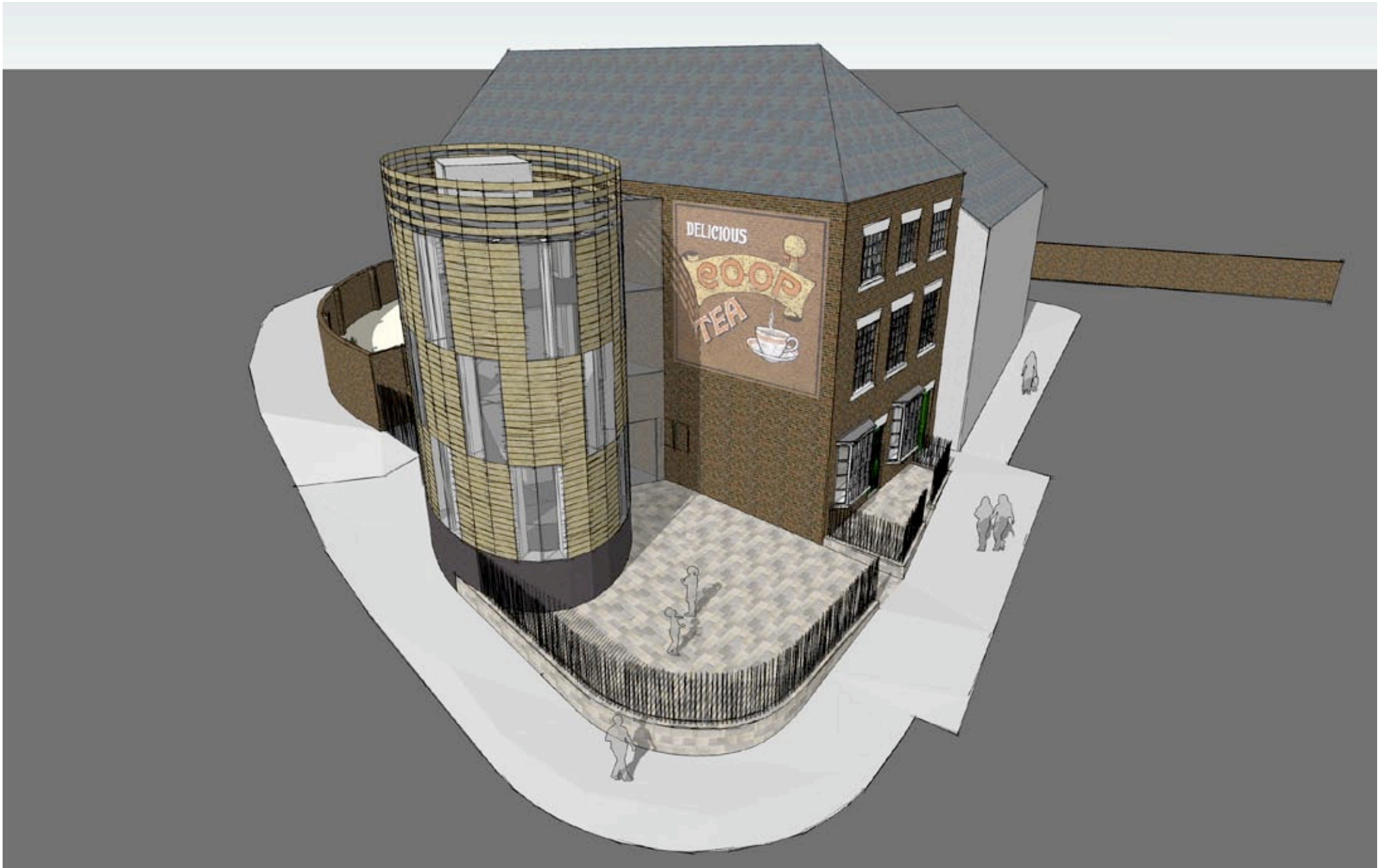
Rochdale Pioneers Museum 13th August 2009 - Proposed Alternative Option